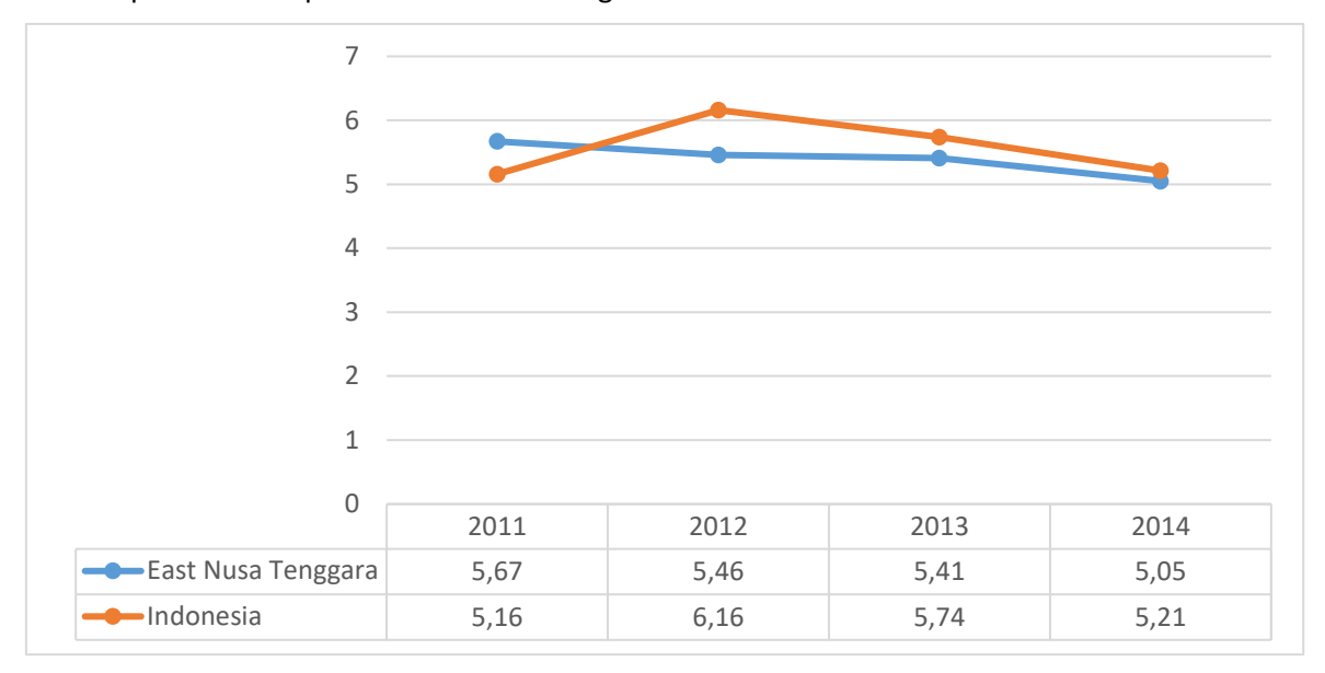
Figure 1. Growth Rate of Gross Domestic Product / Gross Regional Domestic Product Based on Constant Price of 2010

Economic growth in East Nusa Tenggara, in general, is not much different from the national economic growth. East Nusa Tenggara with the diverse natural resources has the potential to improve the region's economy. The economic performance of East Nusa Tenggara during 2011-2014 tended to decline with an average growth rate of 5.4 percent, lower than the national economic growth rate in the same period of 5.9 percent as shown at Figure 1.